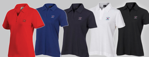
818 Pink 35 Red 52 Tour Blue 58 Navy Blue 00 White 99 Black