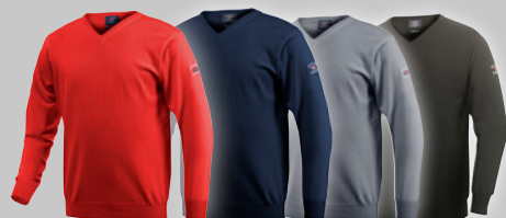
818 Pink 1430 Bright Red 1390 Navy 1970 Antracitemel 1999 Black

Modern V-neck sweater made of 100 % high-quality wool. Designed to follow your movements.