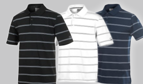
562 Oxford 99 Black 00 White 58 Navy