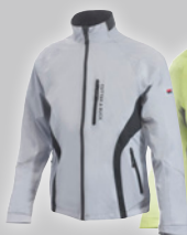
2430 Bright Red