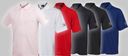
562 Oxford 818 Pink 00 White 35 Red 58 Navy Blue 99 Black 52 Tour Blue