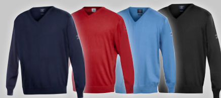
00 White 58 Navy 351 Cradinal R 53 Sea Blue 99 Black