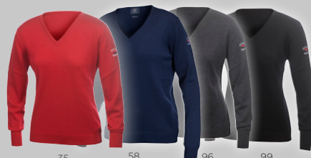
818 Pink 35 Bright Red 58 Navy 96 Grey Melange 99 Black

Knitted v-neck sweater made of extra fine resilient Baruffa Merino wool.